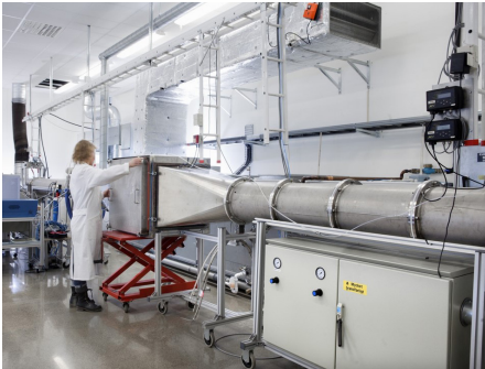
In Camfil's molecular media test rig in Trosa, Sweden, various filtration technologies are challenged with different gases at realistic concentrations against a wide range of temperature, humidity, and airflows.

Effective solutions for the removal of gaseous contaminants must be validated in accordance with ASHRAE 145.2 and ISO 10121-2. Both of these test standards validate the performance of Gas Phase Air Cleaning devices under actual operating conditions. Performance claims made without this compliance are questionable.